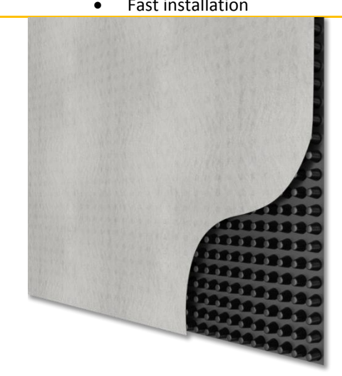
ABG Deckdrain 700S/S170