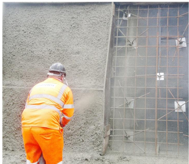
Installation trials demonstrated excellent adhesion of the sprayed concrete to Deckdrain

ABG provided design assistance and technical support during the design, trial and installation on this project.