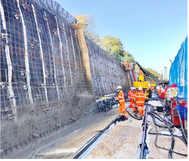
Deckdrain provides an impermeable skin for the drainage system, preventing ingress of concrete

Contact ABG today to discuss your project specific requirements and discover how ABG past experience and innovative products can help on your project.